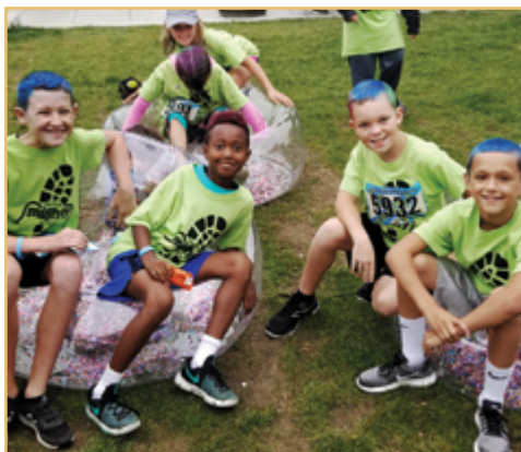
New and old friendships were celebrated on race day!