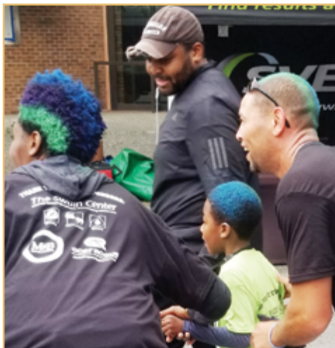
Coaches, families, and the participants all came together to make sure every child got across the finish line!